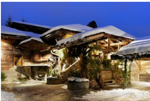
Les Fermes de Marie

The products, inspired by their Alpine surroundings, feature local ingredients like edelweiss, a mountain plant known for its antioxidant and regenerating properties.