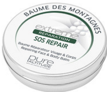
AT ALTITUDE: Pure Altitude's Baume des Montagnes none

We don't think so. For skin that is smooth and glowing from a high-altitude ramble is exactly what the range, launched 10 years ago by the owners of überposh hotel and spa Les Fermes de Marie, promises to deliver.